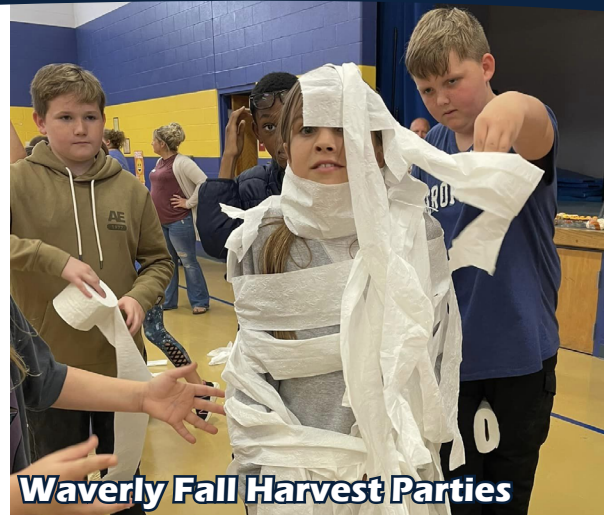
Waverly Fall Harvest Parties