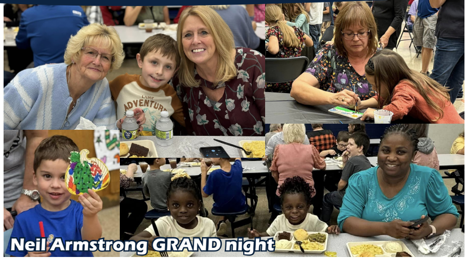
Neil Armstrong GRAND night