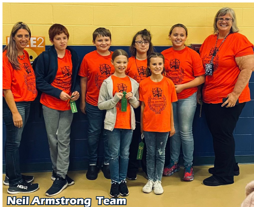
Neil Armstrong Team