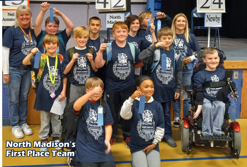
North Madison's First Place Team